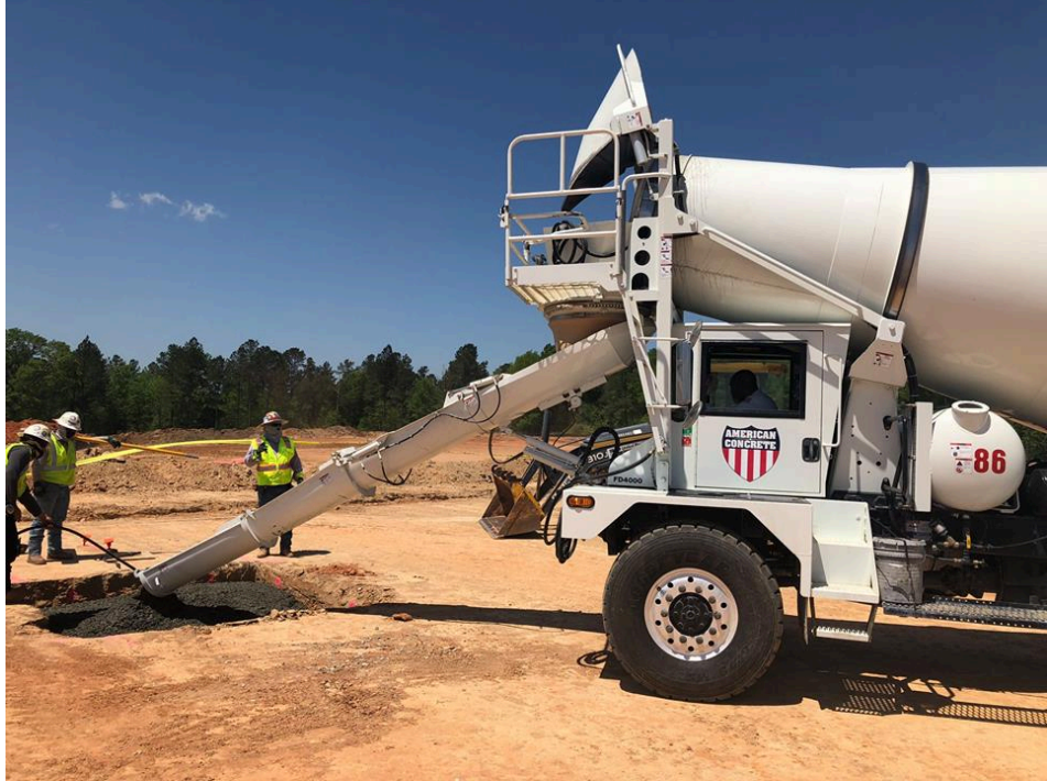
Footings have been poured by local contractors.